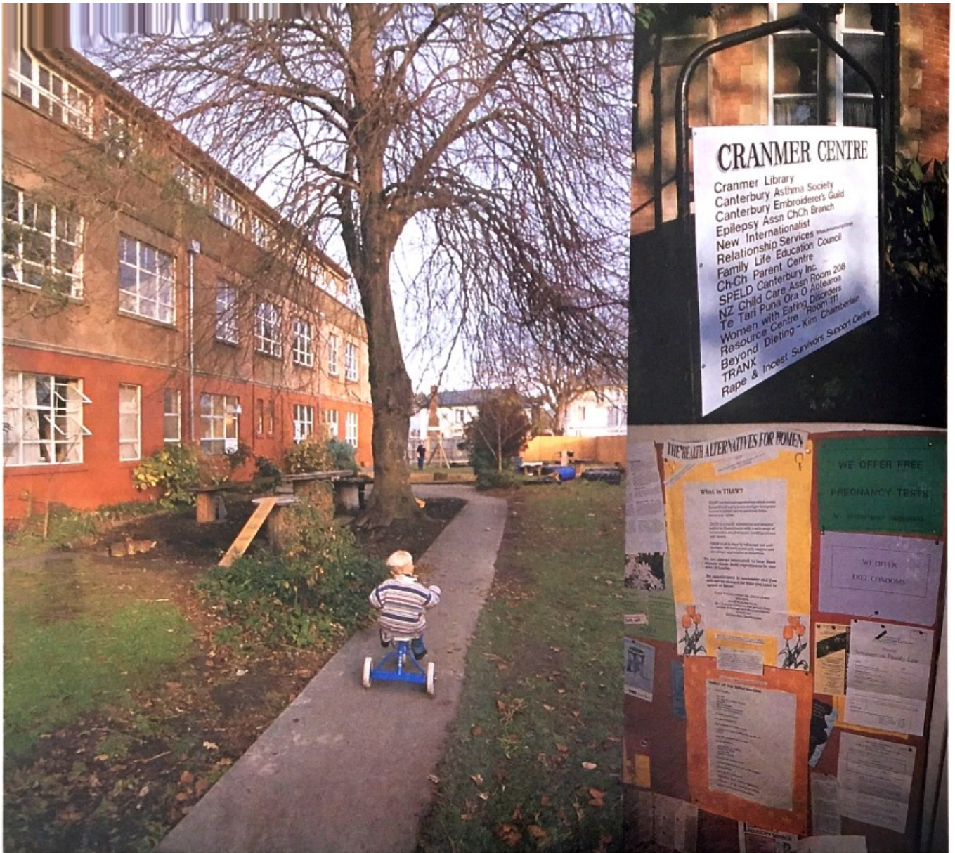
New Zealand's first American-style daycare abuse scandal probably couldn't have happened anywhere but Christchurch, and even there it couldn't have happened anywhere but the Civic Creche. No other city or town in the country had experienced the garden city's run of well-publicised sexual-abuse scares and the Civic Creche was one of a kind, the trendiest creche in Christchurch, if not in New Zealand.

enmeshed in all the collateral and peripheral matters covered in the tapes not relied on by the Crown and about exposing the jury to the playing of many hours of irrelevant material, thereby distracting them from consideration of the real issues.”